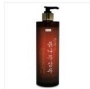
Japanese Sumac Shampoo 500 g