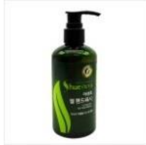
Shue Ne Ra Gel Hand Washer 250 g