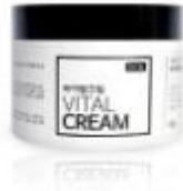
Vital Cream 95 g