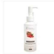
Argan & Resehip Body Oil