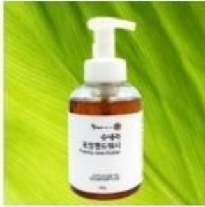
Shue Ne Ra Foaming Hand Waser 500 g