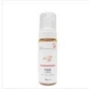
Foaming Cleanser for Women 165 g (Houttuynia cordata)