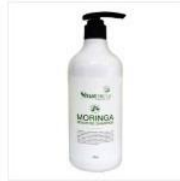
Moringa Shampoo 500 g