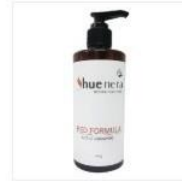
Shue Ne Ra Red Formular shampoo 300 g (Japanese Sumac)