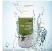
Body Washer 300 g (Houttuynia cordata)