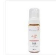
Shue Ne Ra Foaming Cleanser for Women 150g (Houttuynia Cordata)