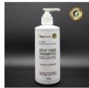
Shue Ne Ra Kelp Shampoo 300 g