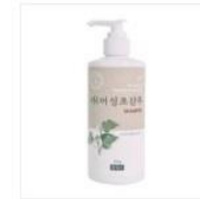
Houttuynia cordata Shampoo 300 g/ 500 g