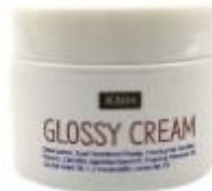
Glossy Cream 95 g