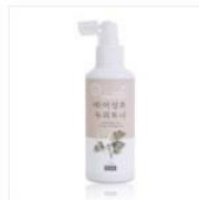
Houttuynia cordata Hair Tonic 150 g