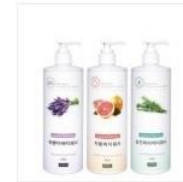
Body Washer (Rosemary, Lavender, Grapefruit)