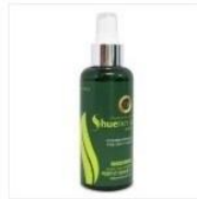
Shue Ne Ra Hair Tonic 150 g