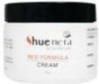
Shue Ne Ra Red Formular Crea 95 g (Japanese Sumac)