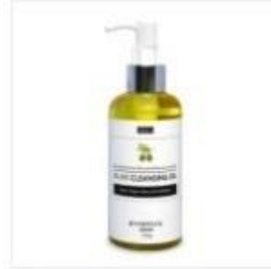
Olive Cleasing Oil 190 g