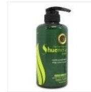
Shue Ne Ra Shampoo 300 g/ 500 g