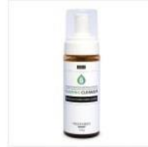
Foaming Cleanser 165 g (Houttuynia cordata )