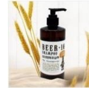
Beer 10 Shampoo 300 g (Beer Yeast)