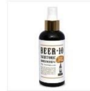
Beer 10 Hair Toner 150 g (Beer Yeast)